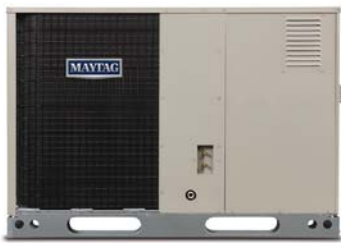
GAS/ELECTRIC PACKAGED SYSTEM MODEL

Select products feature a two-stage technology which allows your packaged system to operate at the most efficient level for total indoor comfort regardless of the outside temperature. A variable-speed blower provides extra quiet operation and improved indoor air quality.