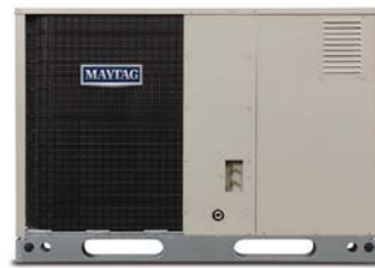
iHybrid® DUAL FUEL PACKAGED SYSTEM MODEL