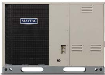
ULTRA-LOW NOx GAS/ELECTRIC PACKAGED SYSTEM MODEL

The ultra-low NOx packaged system utilizes a pre-mix burner with a woven ceramic fiber material developed for the space program. Through this technology, the reduction of NOx results in a decrease of smog and acid rain. These packaged systems offer an earth-friendly option for the environmentally-conscious homeowner.