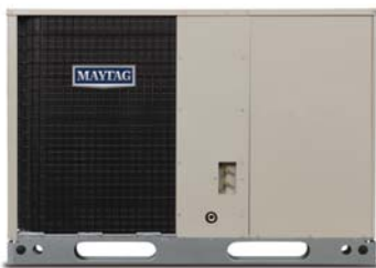
LARGE PACKAGED SYSTEM MODEL

Select products feature a two-stage technology which allows your packaged air conditioner or heat pump to operate at the most efficient level for total indoor comfort regardless of the outside temperature.