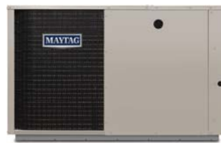
SMALL PACKAGED SYSTEM MODEL